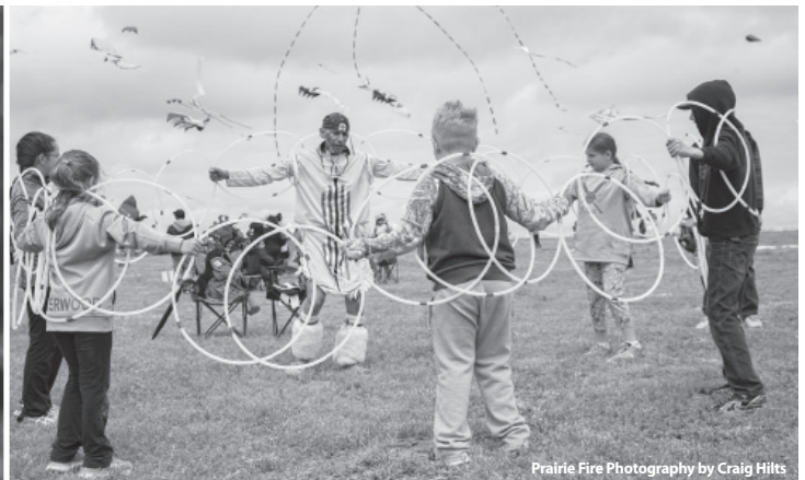
Prairie Fire