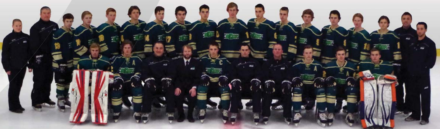
TEAM SASKATCHEWAN HOCKEY - MALE Prince George 2015 Canada Winter Games